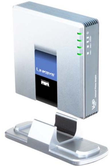
Figure 3-5: Attach the Phone Adapter's Stand (Optional)

Congratulations! The installation of the Phone Adapter is complete.